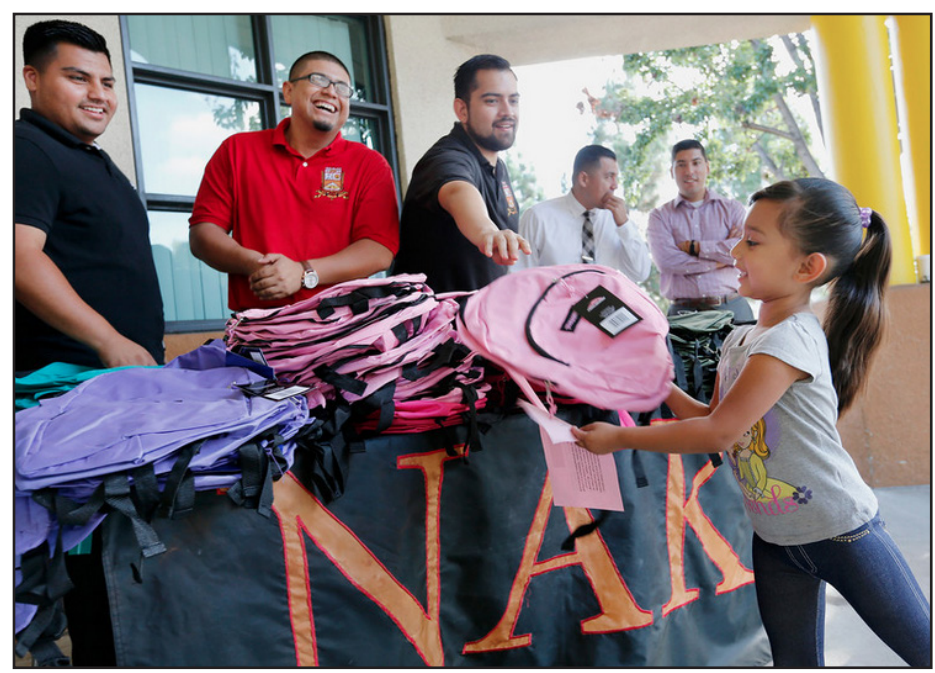
The National Alumni Association led a backpack giveaway of more than 500 backpacks to a low-income elementary school in the Bay Area in mid-August.

On Thursday, August 13, the National Alumni Association led a backpack giveaway drive to Rosemary Elementary School, where more than 85 percent of the students are on free or reduced lunch.