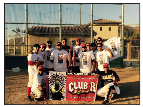
Congratulations to Club R for winning the 2015 NAK Alumni Softball tournament!

Great job to the organizers of this event and congratulations to all of the teams!